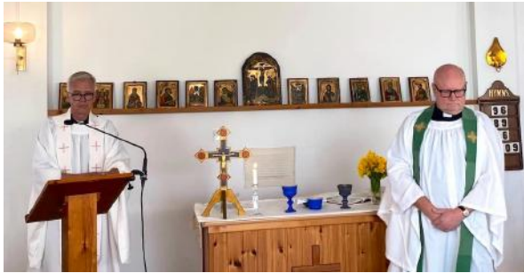
Ayia Napa welcomes new priest to Scandinavian Church