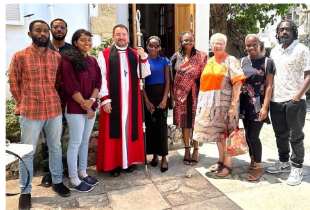
Worship with Famagusta Student Chaplaincy