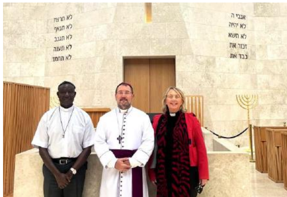
Abu Dhabi: visiting Abrahamic Family House