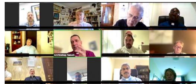
Archbishop Hosam: the only way forward is peace