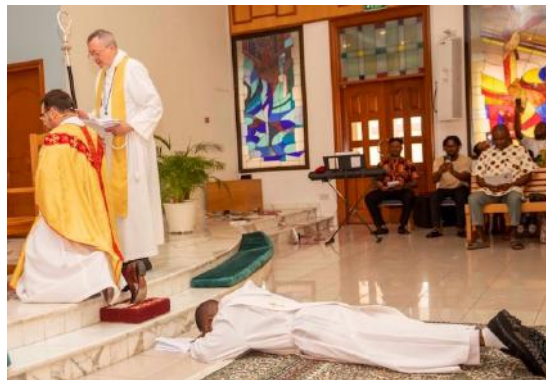
UAE: an ordination and Feast of St Luke