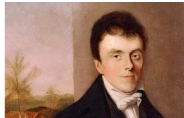
Canon Theologian: on Henry Martyn