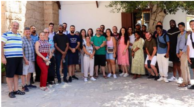
2024 Provincial Youth Conference