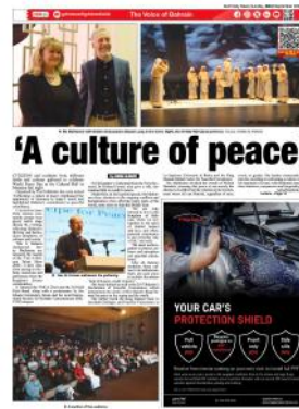
Dean of St Christopher's Cathedral, Bahrain addresses UN Peace Day meeting