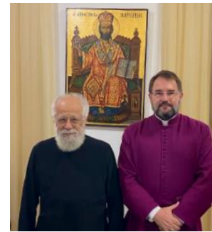
Meeting Metropolitan Vasilios