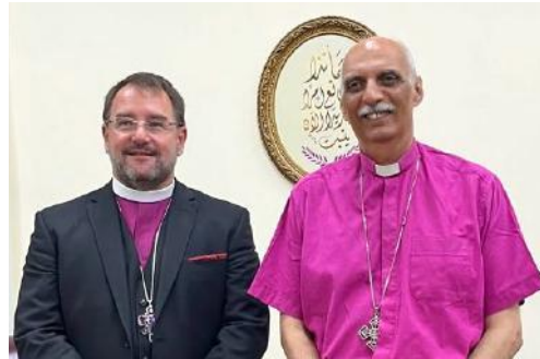
Archbishop Samy invites Bishop Sean to address clergy in Cairo