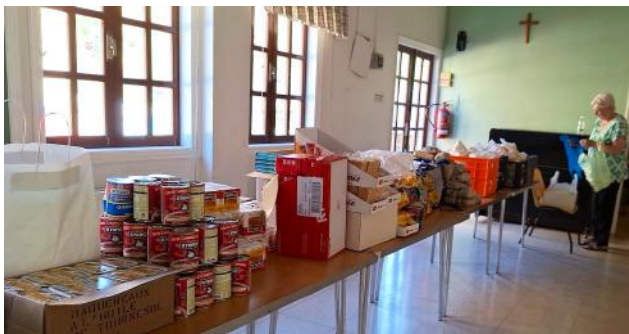
St Paul's Cathedral, Nicosia hands out 1,500th food parcel