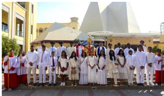
Holy Trinity Dubai celebrates Confirmations