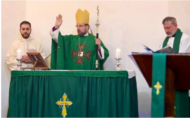
Holy Communion at St George Baghdad