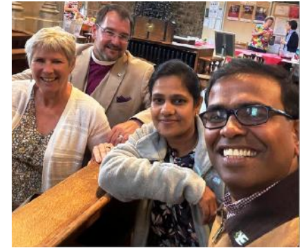
Catching up with Friends of the Diocese