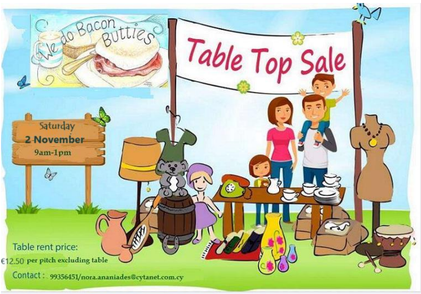
Table Top Sales